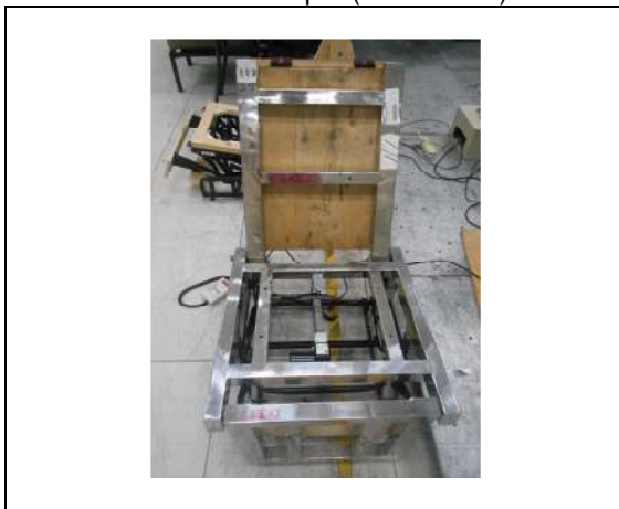
Received sample (With frame)