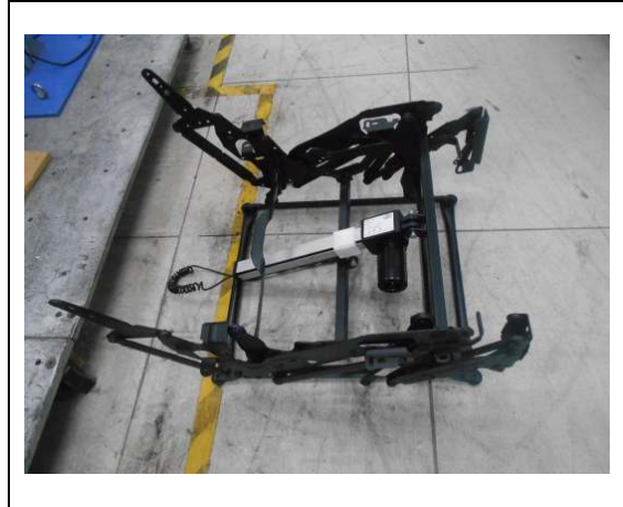
Received sample (Side View)